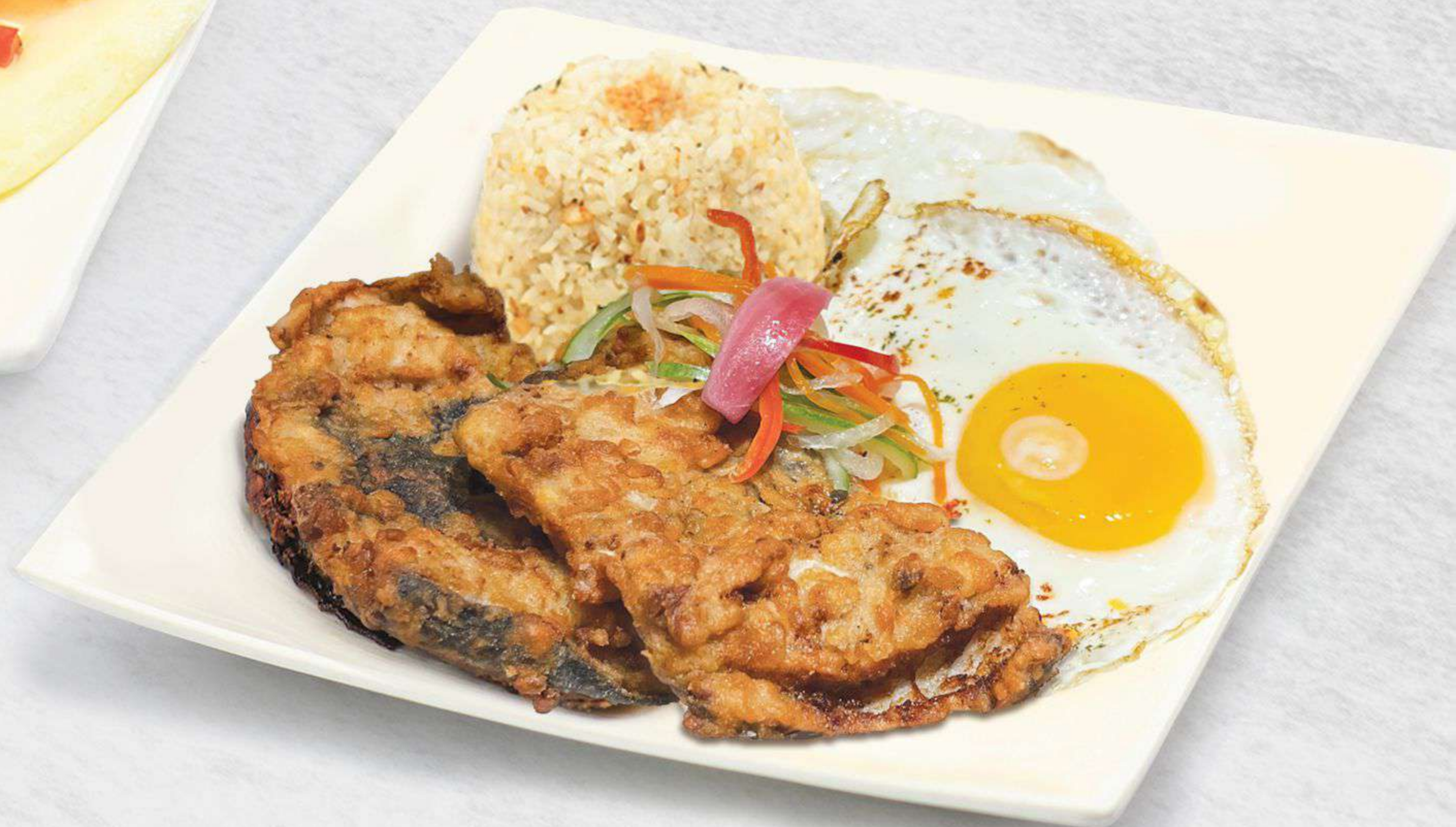
Daing na Bangus