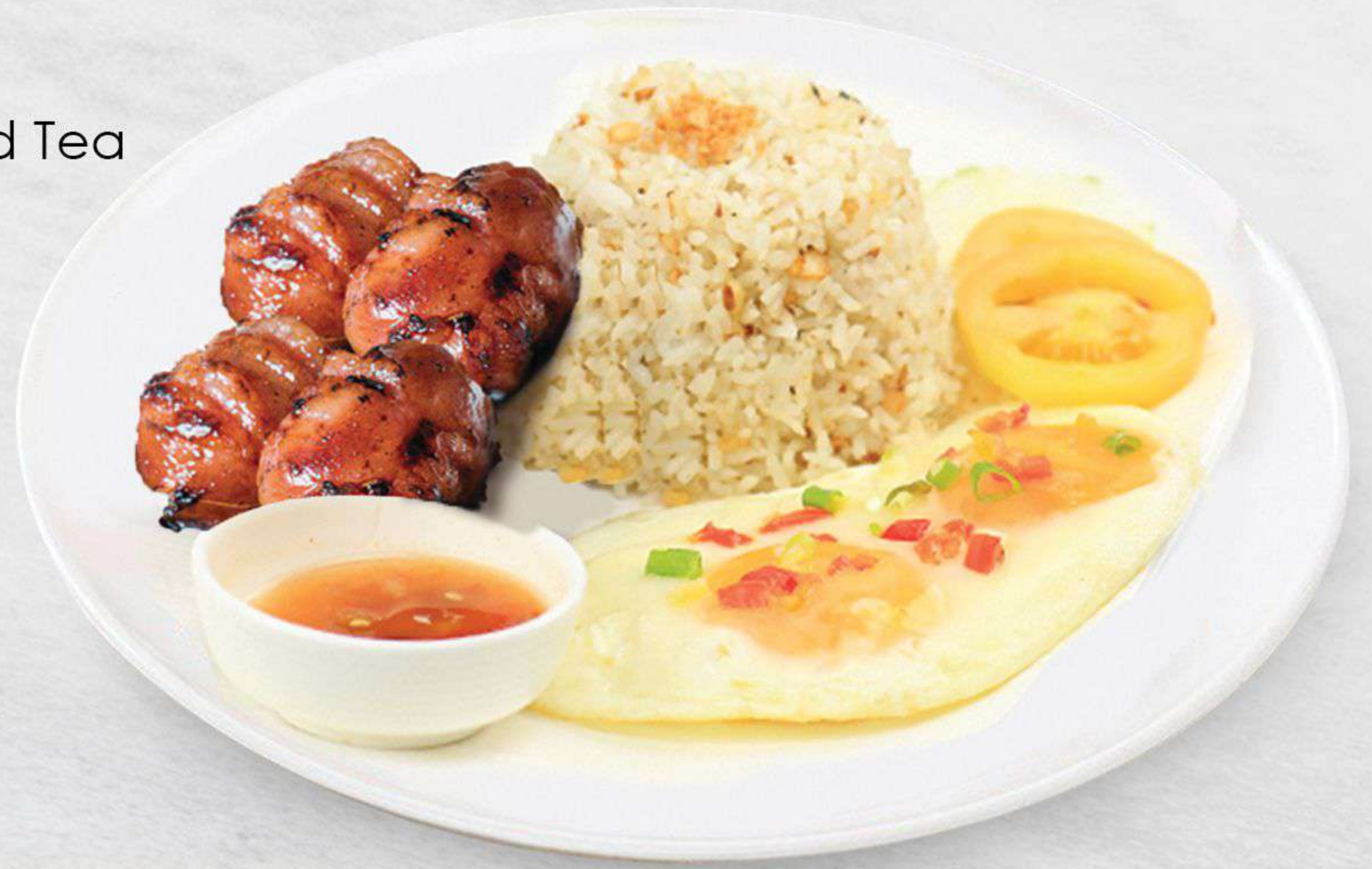
Chorizo De Cebu